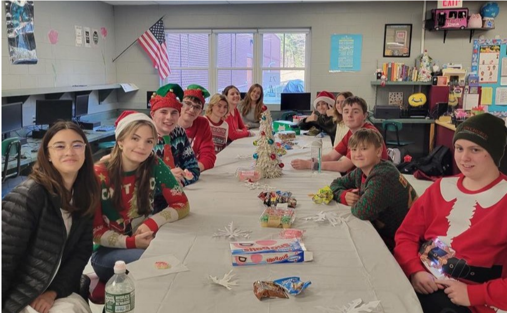
Prospect Mountain FBLA Chapter at their holiday party in Alton, NH

Recently, the Prospect Mountain FBLA chapter has been working hard on the state officer projects, champion chapter goals, and FBLA week events. Still, while planning upcoming activities, they have been hosting community events. One of the things FBLA does at PMHS is run their school store, called the Wolf Den. Throughout December, they held a different sale every day to celebrate the holidays, including specific sales for the clubs and staff members. Connecting with the community, PMHS FBLA put forth announcements and decorated the school store, bringing holiday cheer to Prospect.